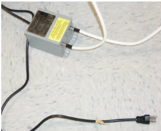
Power Pack with Bars connected

Baumfolder Corporation 1660 Campbell Rd., P.O. Box 728 Sidney, OH USA 45365-0728 Phone: 937-492-1281 or 800-543-6107 Fax: 937-492-7280 email: BAUM@bright.net