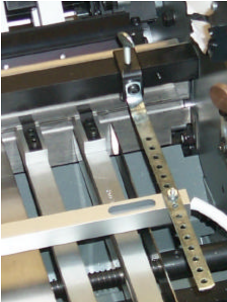
Entry Side Bracket