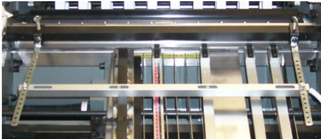
Static Eliminator Bar Mounted on Entry Side of Baumfolder 2020 Folder

The hardware kit consists of universal mounting brackets that must be bent to fit the folder. The universal bracket kit is used because there are so many different folders in the market. Note that there are different "C" brackets for the tiebars. This is also due to the wide variety of folders that this accessory is used on.