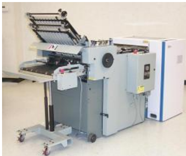
Baum 20 In-Line Folder with Bowie

Yes, the Baum 20 In-Line Folder was specifically designed to do this type work. This folder is a unique design that eliminates the labor of loading traditional cut sheets. The Baum 20 In-line Folder is designed to be an integral part of a complete high-speed electronic printing continuous forms system.