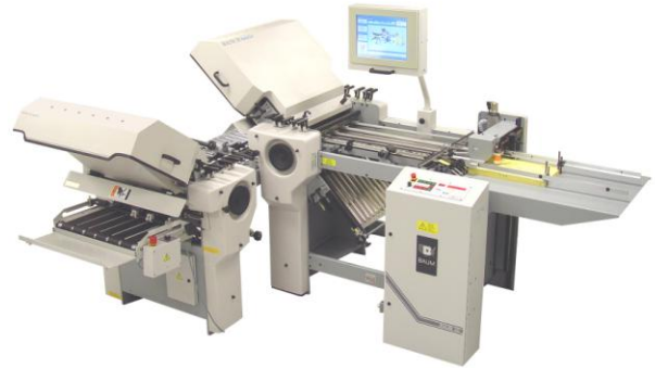
BAUM 20 AUTOSSET

The need for automating and or improving the folding process has become more prevalent today than ever before due to the following factors: